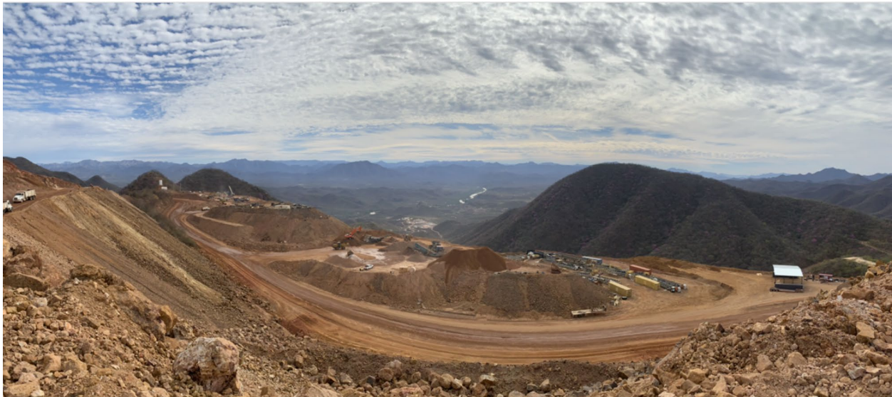
Figure 4: Crushing of stockpile at San Antonio

The San Antonio Gold Project, located in the state of Sonora, Mexico, includes five known deposits and at least a dozen other gold exploration targets over 11,338 hectares. A recent mineral resource estimate (see news release dated June 30, 2022) includes 576,000 oz of Au and 1.37 million ounces of Ag (14.9 million tonnes grading 1.2 g/t Au and 2.9 g/t Ag) in the indicated mineral resource category and 544,000 ounces of gold and 1.76 million ounces of silver (16.6 million tonnes grading 1.0 g/t Au and 3.3 g/t Ag) in the inferred mineral resource category. The San Antonio Project gold mineralization is characterized by hydrothermal breccia that forms an approximately 3,000 metres long east-northeast trending mineralization corridor with the Luz del Cobre copper deposit at the east.