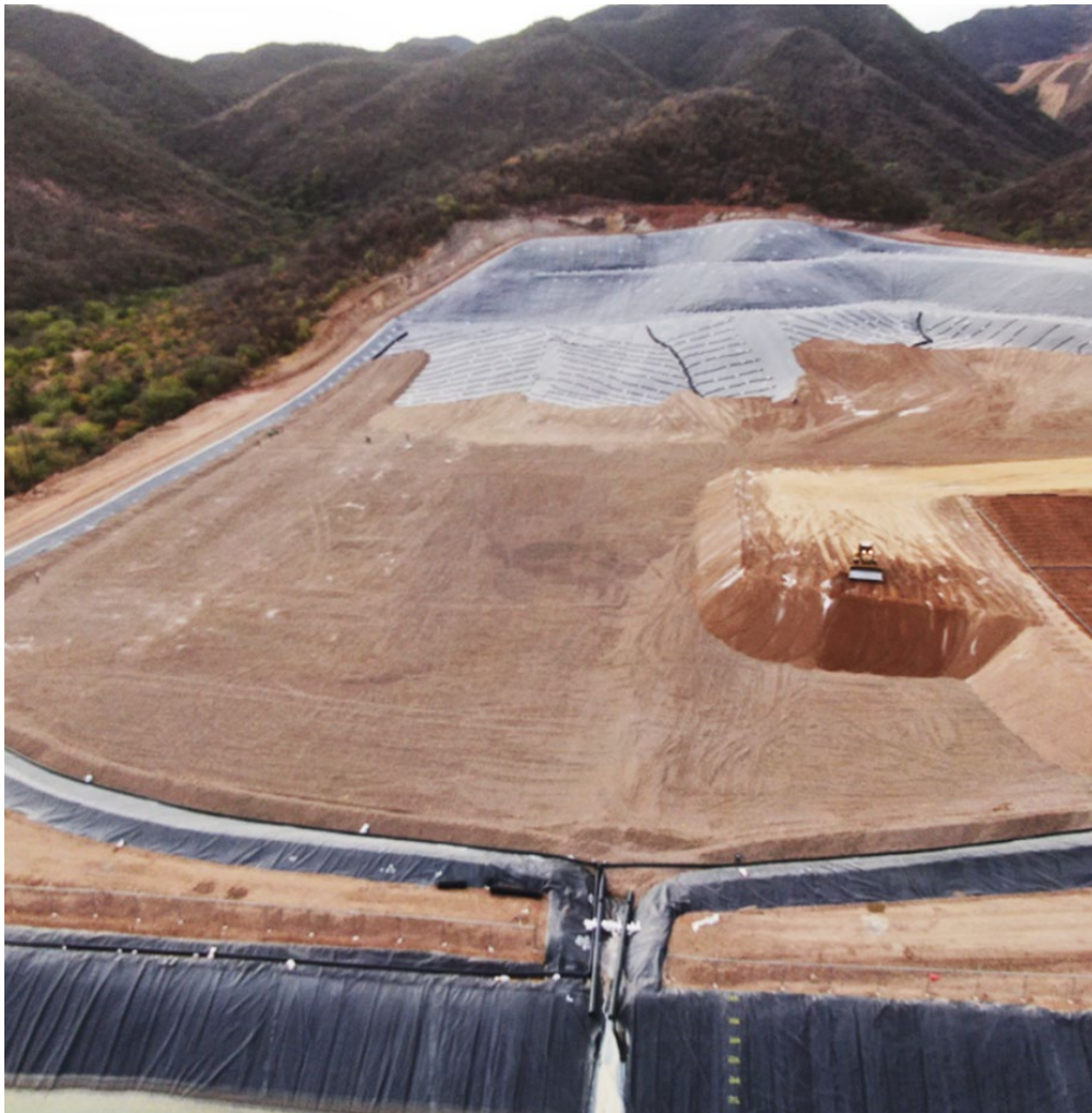
Figure 5: Stockpile placed on newly constructed leachpad