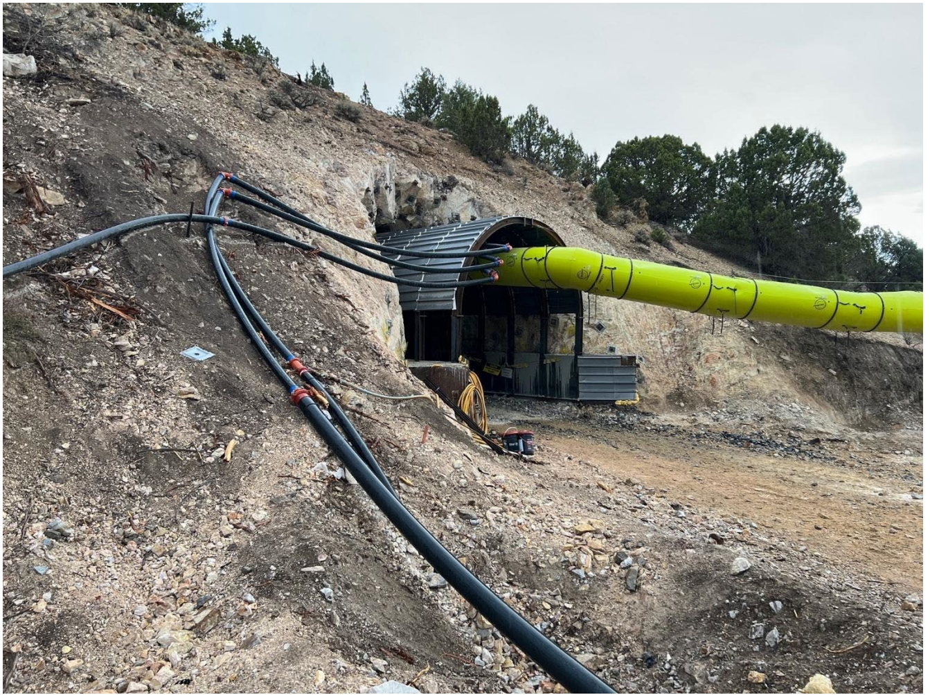
Figure 1: Trixie Portal