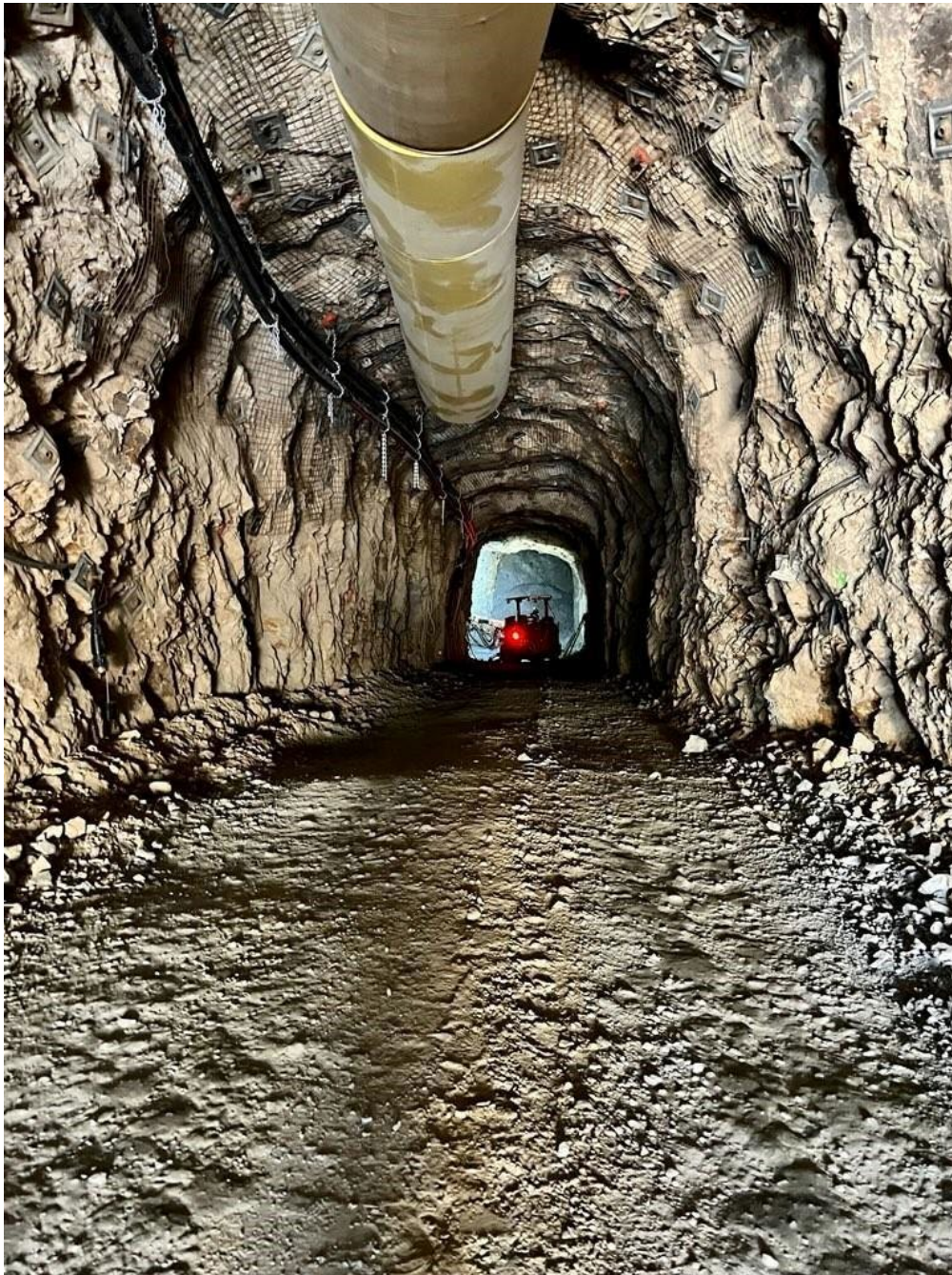
Figure 2: Trixie Decline